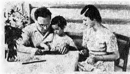
10. The family, 1945